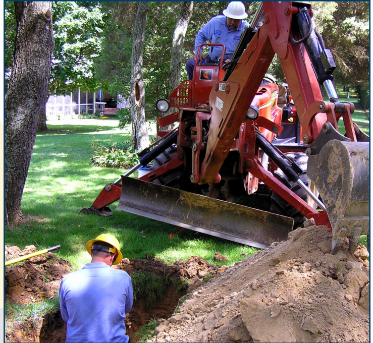
BTES crews will soon begin replacing underground facilities in several neighborhoods to help increase the reliability of our services to customers and enhance the safety of our employees.

These buried lines, while unseen, still incur damage as they age. Damage may also occur when someone fails to call Tennessee’s One-Call Center (call 811 or visit www.tennessee811.com ), and accidentally digs into a buried line. This is not only extremely dangerous, but could potentially result in costly repairs and lost productivity due to resulting electric or fiber outages.