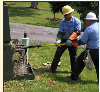
Crews need a minimum clearance of 10 feet to safely operate equipment.

Additionally, above-ground equipment, such as pad-mounted transformers, switching pedestals, vaults and pull boxes, must remain clear and unobstructed — as they were when they were originally installed. Specific clearances need to be maintained around these devices so our crews can access and operate this equipment in a safe and timely manner.